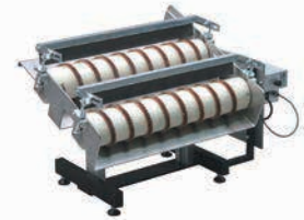
MSR-600 with double screw for die-cast parts