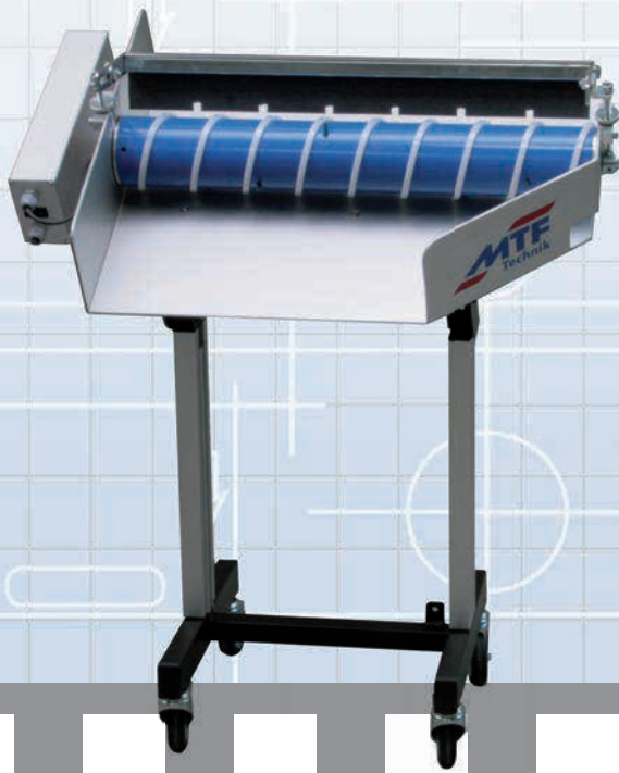
MTF Multi-Separator MSL-600