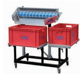
MSL-800 with box support